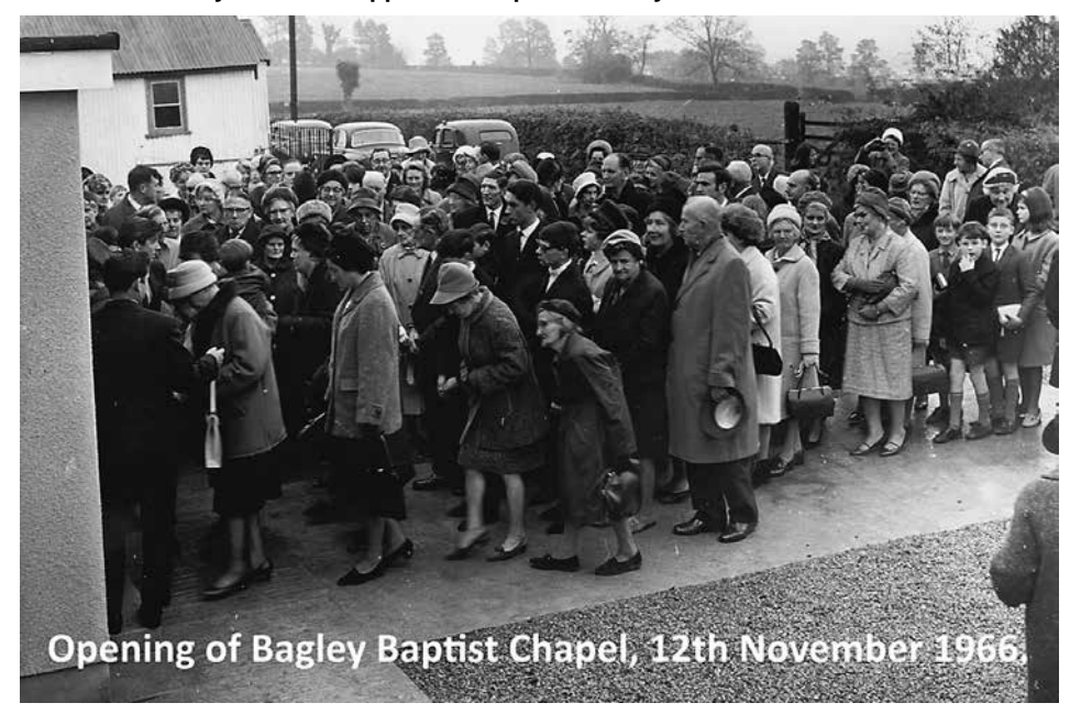
Opening of Bagley Baptist Chapel

Saturday 12 November will be the 50th Anniversary of the opening of the little Baptist Chapel at Bagley. Were you there? Do you know someone who was? Would you like to see some wonderful history of our area? If so, you're invited to a Harvest Supper and a showing of some cine film of the building process! There's no charge, we'd just love to have your company, but for catering purposes please let us know by the end of October if you're coming. Thank you.