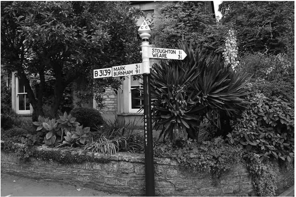
Renovated signpost at the bottom of Lascot Hill