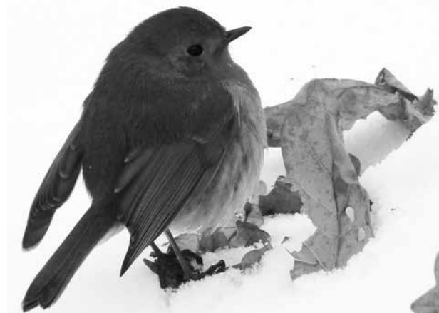
Robin

Join the fun making natural Christmas crafts: wreaths, hazel Santas or elves, miniature Christmas trees and more. Help decorate one of the Brewhouse's 'Around the World' Christmas trees. The Brewhouse, Coal Orchard, Taunton TA1 1JL. Children must be accompanied by an adult. For more information and to book your place please contact the Brewhouse on 01823 283244 or visit www.thebrewhouse.net . Free event. Donations Welcome