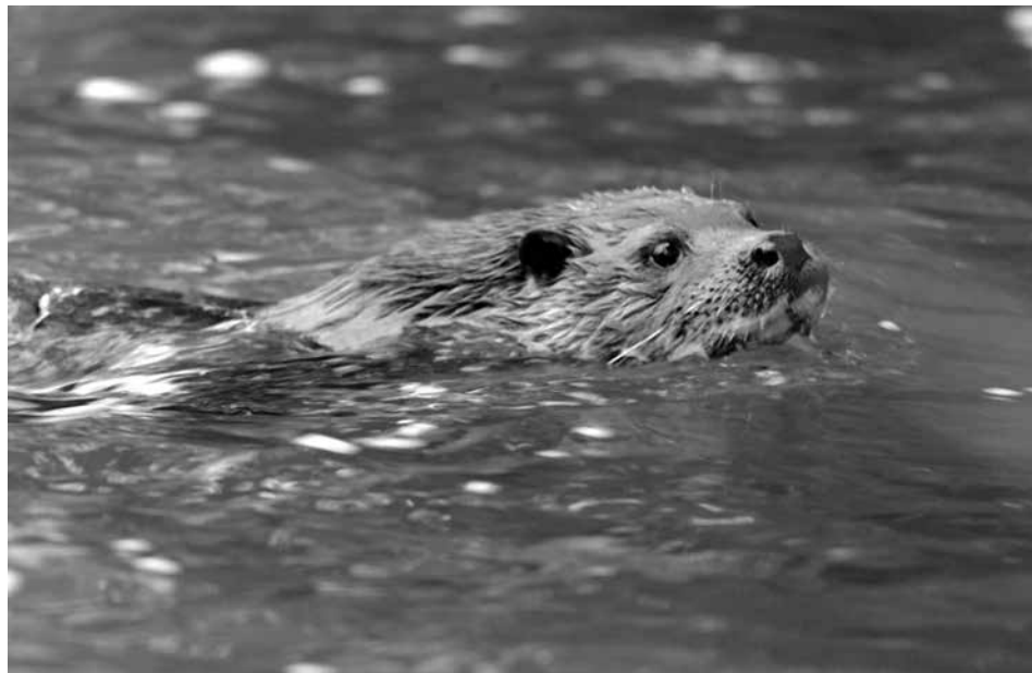
Otter