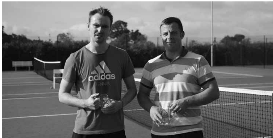
Men's Singles Fina