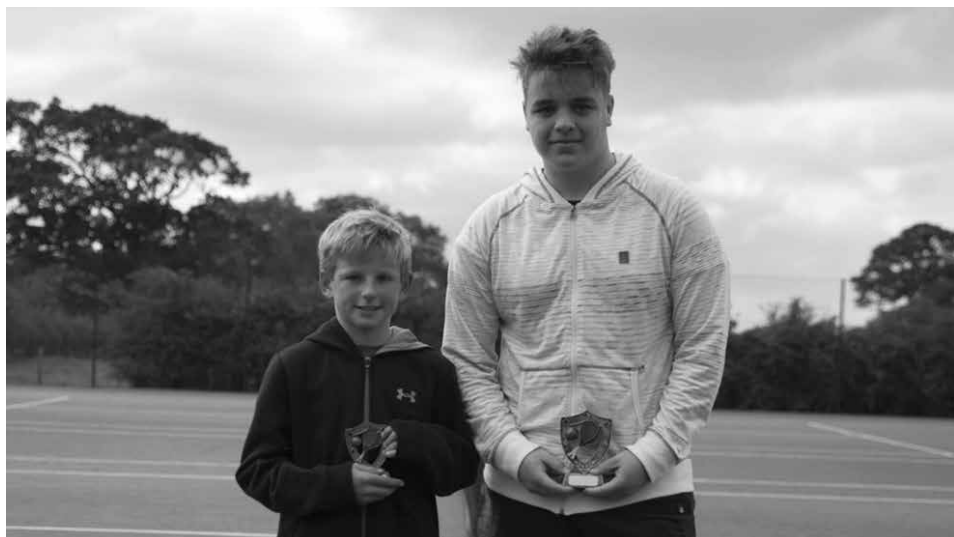
Boys' Singles Final