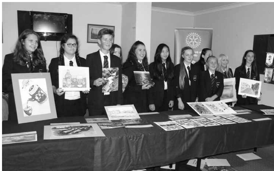
Young Artist prize winners