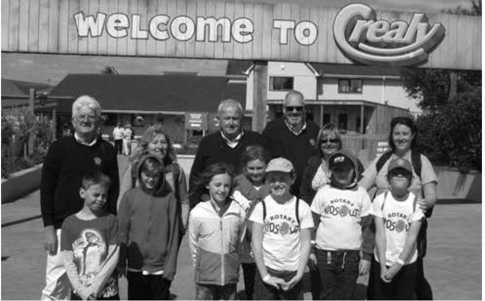
Mendip Rotarians with local schoolchildren and staff enjoy 'Kids Out' at Crealy Park

Members of the Rotary Club of Mendip recently took some local children out for the day to Crealy Park near Exeter. 'Kids Out' has been running since 1990 and is delivered nationally in conjunction with Rotary International in Great Britain and Ireland. It provides children with an experience that brings both fun and happiness into their lives. More than 100 venues and 10,000 Rotary volunteers have made the day out the