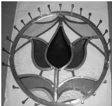
The stained glass work our speaker was demonstrating