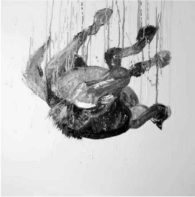
Horse falling