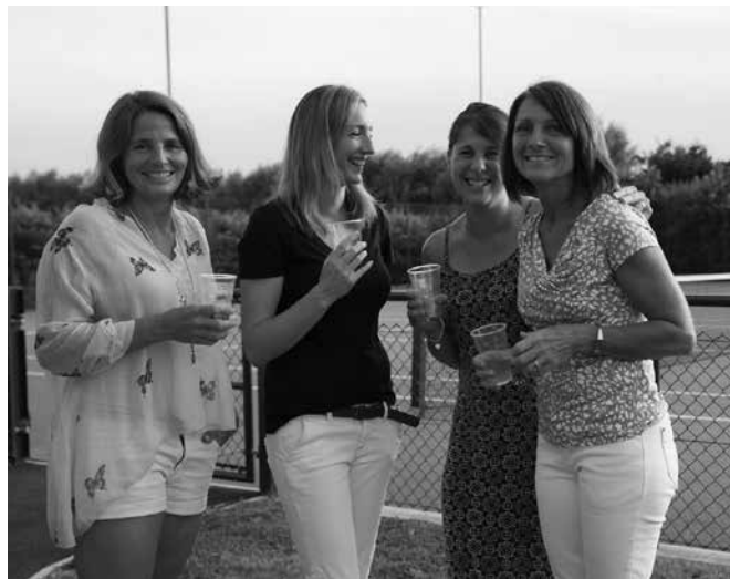
The A Team

League players gathered at the clubhouse on a sultry 19 July evening to celebrate and mark the end of the season.