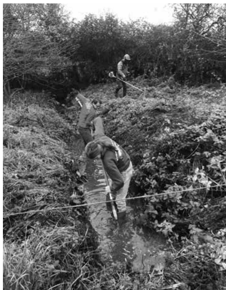
Rob Richley, Green Wedmore

The community woodlands are a 15-minute walk from the village centre; starting at the public footpath at the end of The Lerburne, go over the footbridge on the right and follow the round green signs to Terry's Wood.